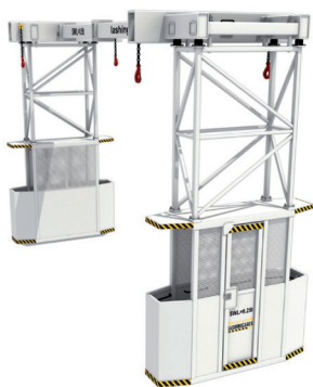
Telescopic or Fixed Gondola Cage